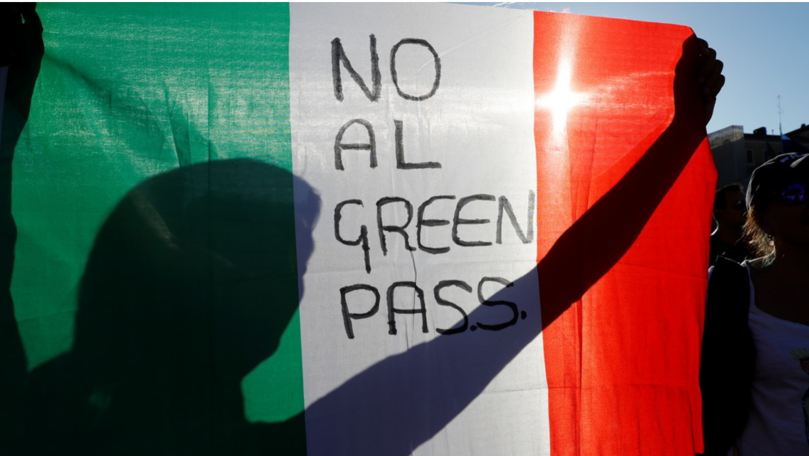
FILE PHOTO. Protesters demonstrate against the Green Pass plan (health pass) in Rome, Italy.